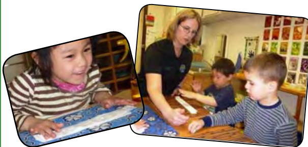
Students at Fairbanks Montessori School learn to make carrot seed tape for Alaska Ag Day 2012.

Don't forget to check us out on facebook at: www.facebook.com/AlaskaFarmToSchool .