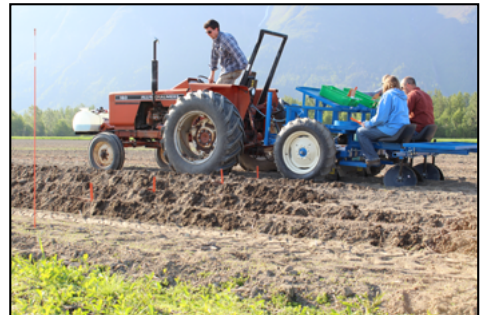
U.S. Farms custom two-row planter being used to plant potatoes.