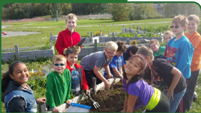
Fourth graders harvesting potatoes.

school garden that is low maintenance AND works with the summer break schedule. We start by doing an agricultural lesson with third graders about the certified seed potato program and potato planting. We then plant the potatoes with the students before school gets out. When school starts up again next year we will harvest the potatoes with the new fourth graders and they will sell them for money to use on their field trip! This cycle and activity was inspired by the Galena potato project funded by a Farm to School grant in 2011. We recommend it for any community that struggles with maintaining a garden over the summer and fitting lessons into the school year.