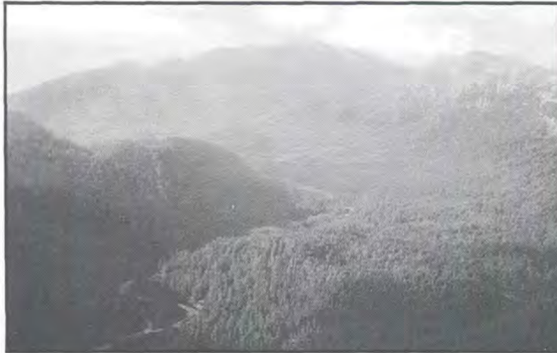
White River valley