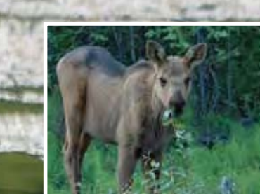
Moose calf