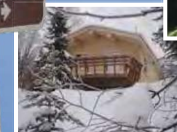
Lower Angel Creek public-use cabin