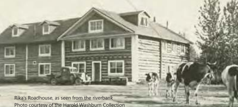
Rika's Roadhouse, as seen from the riverbank.

Today, when you drive through the Northern Area, you are more than likely following historic routes. The Richardson Highway is Alaska's oldest highway, designed to link the coast and the rich resources of the interior. The Alaska Highway is the result of an incredible effort during World War II when over 1,600 miles of pioneer road were built during one short construction season.