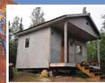
Upper Angel Creek public-use cabin