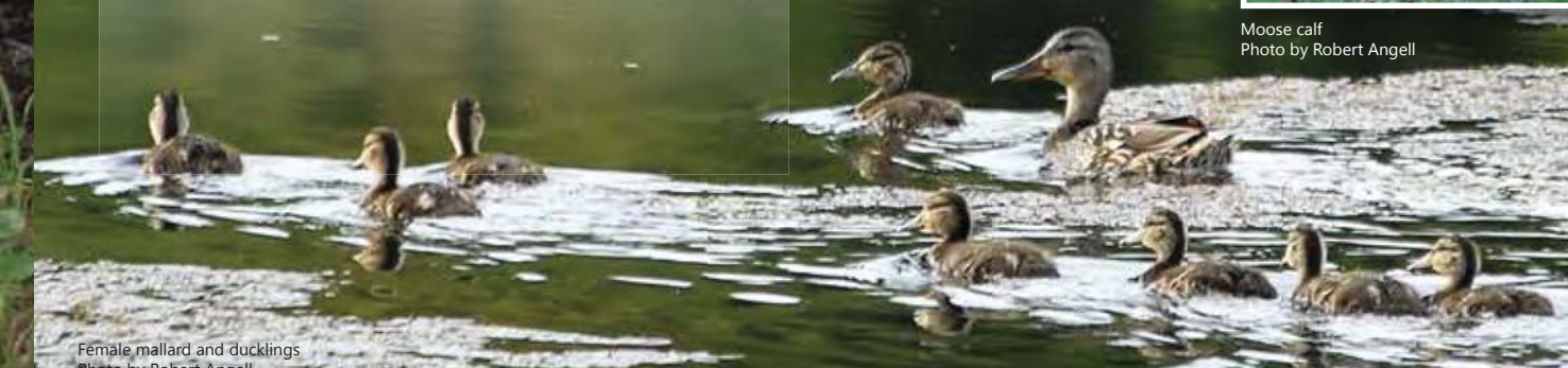
Female mallard and ducklings