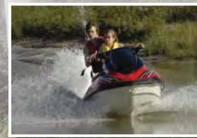
Harding Lake

Don't even think about following the bear's example and sleeping through winter! The parks in this area beckon visitors to enjoy the snow and invigorating cold air. Try your hand at ice fishing, ski on groomed trails, snowmachine on fresh powder, go skijoring with your pooch, or enjoy the dazzling winter scenes as you hike along in snowshoes.