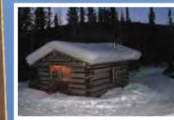
Nugget Creek public-use cabin