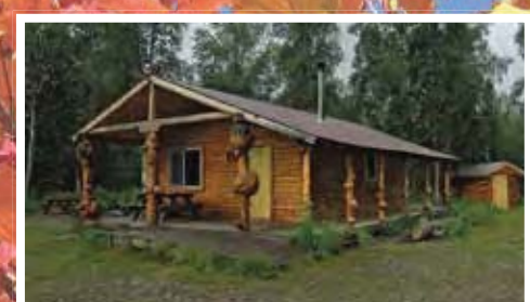
Chena River public-use cabin