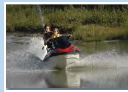
Delta-Clearwater River