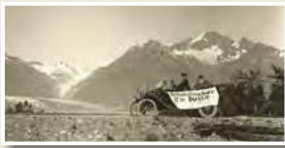
View of men riding in Model T Ford with banner, Valdez-Fairbanks Trail, Valdez, Alaska. AMRC-b62-1-a-83, Cray-Henderson Collection