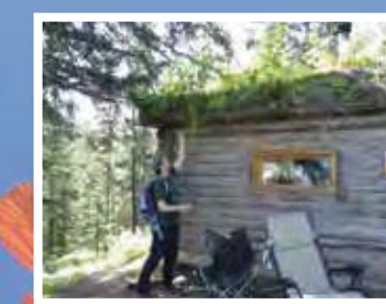
Glattfelder public-use cabin