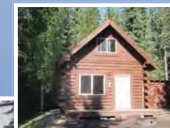
Hunt Memorial public-use cabin