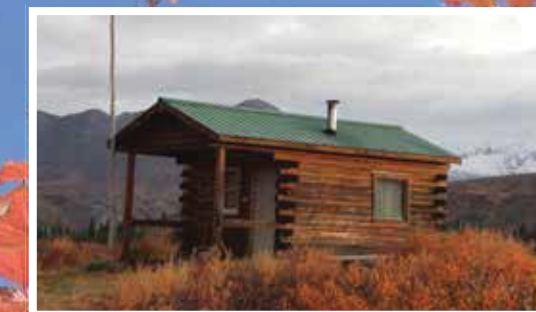
Fielding Lake public-use cabin