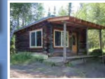
Colorado Creek public-use cabin