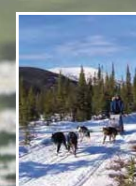
Angal Creek Valley