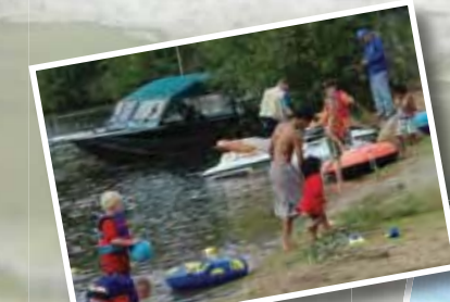
Harding Lake

Spring flows in with break-up, new buds and leaves, and thousands of migratory birds, beckoning hibernating people to get out and stretch their legs.