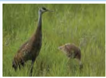
Sandhill Crane