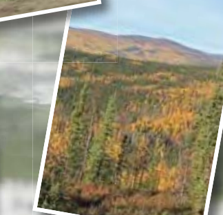
Stiles Creek Trails in Chena River-SRA