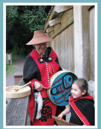
Haida Descendant Dancers