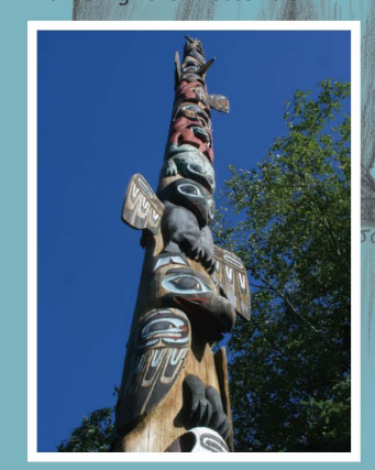
Pole on the Point Background sketch: Man Wearing Bear Hat