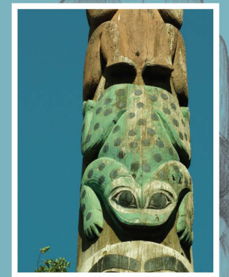
Wandering Raven House Pole