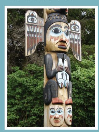
Kadjuk Bird Pole