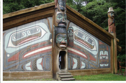
Clan House entrance

Totem Bight State Historical Park sheltered in a lush, temperate rainforest rich in Native history and art, beaches with waterfront views, and indigenous plants and animals—it is the top pick for visitors and residents alike.