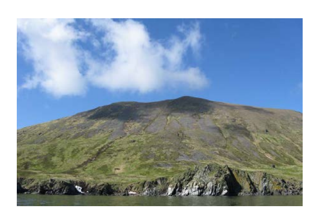
Walrus Islands Archeological District National Historic Landmark Togiak January 11, 2017