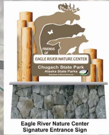
Eagle River Nature Center Signature Entrance Sign

Proposed Parking Nature Center Parking 41 - 10' x 25' 19 - 10' x 20' 6 - ADA 11' x 20' w/ 5' Isles 8 - 12' x 40' Pull Through Total Nature Center Parking 66 Cars / Pick-Ups 8 Oversized Vehicles Trailhead Parking 22 - 10' x 25' Staff Parking 5 - 10' x 20' TOTAL - Phase I PARKING 88 - Car & Pickup Parking Spaces 8 - Oversized Vehicles